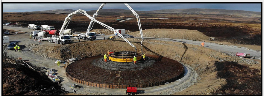
Above: The concrete & steel base of a Turbine. These structures are the same as are being proposed in all the Bute Energy Cambrian Mountains Wind Farms.